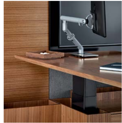
Height-adjustable work surfaces