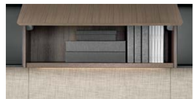
Closed overhead storage

For more information, please visit geigerfurniture.com/rhythm or call 800.456.6452.