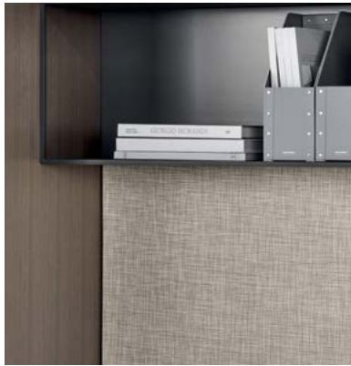
Overhead containers, including frame-mounted open metal shelves