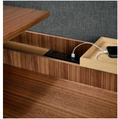
Technology support with optional wireless charging