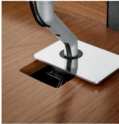
Swivel lid conceals power access