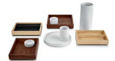
Storage trays and porcelain containers