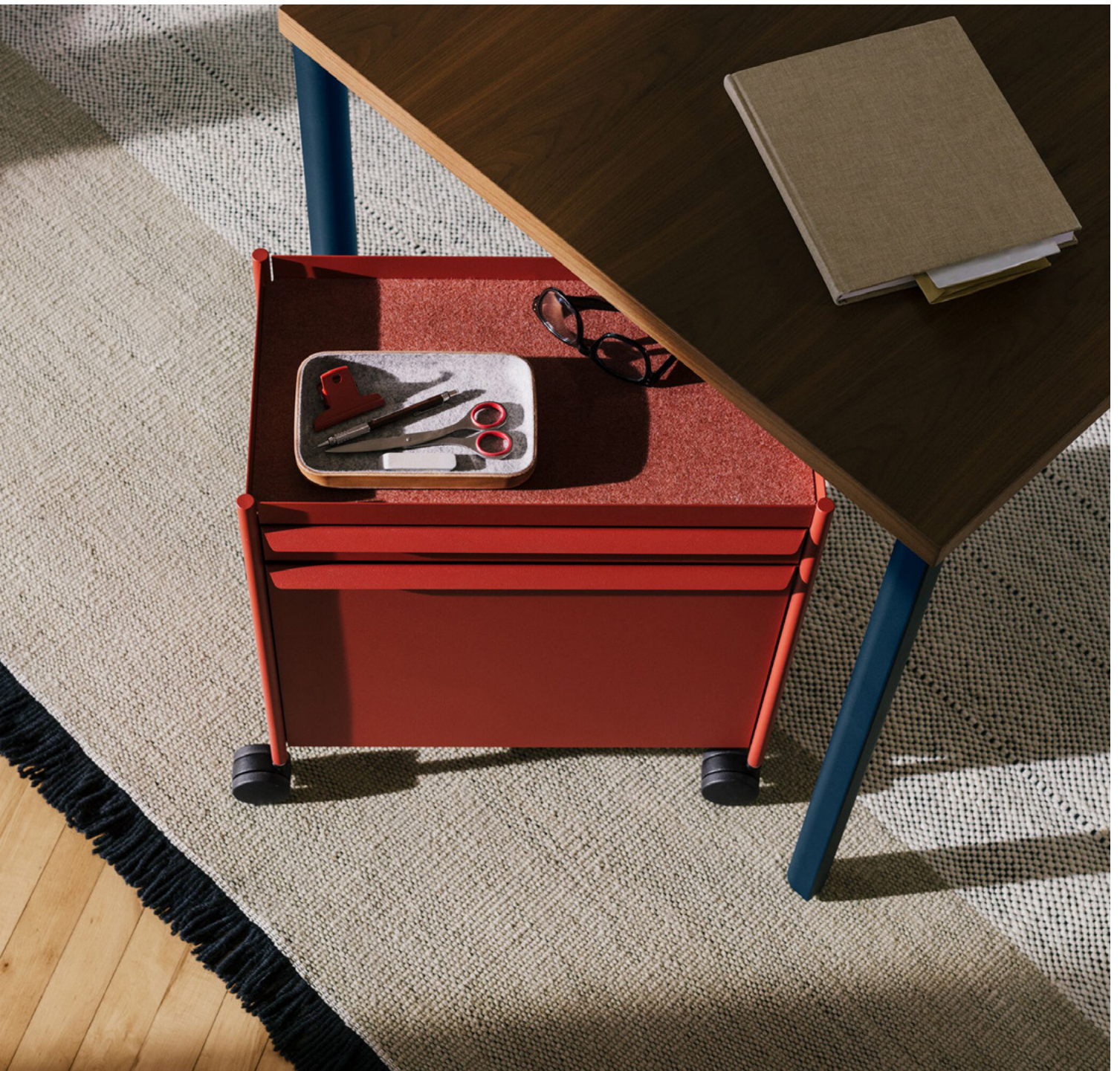
OE1 Storage Trolley, OE1 Rectangular Table