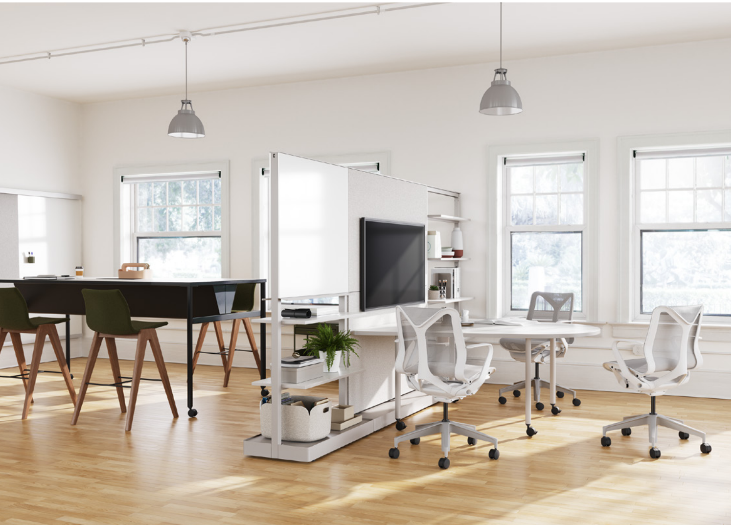
OE1 Wall Rail and Board, OE1 Communal Table, OE1 Agile Wall, OE1 Huddle Table