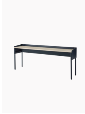
OE1 Communal Tables