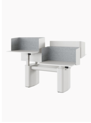
OE1 Micro Packs