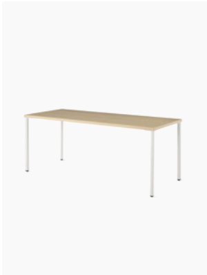
OE1 Rectangular Table