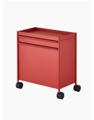
OE1 Storage Trolleys