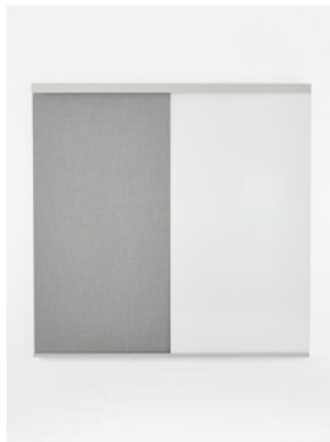
OE1 Wall Rail and Board