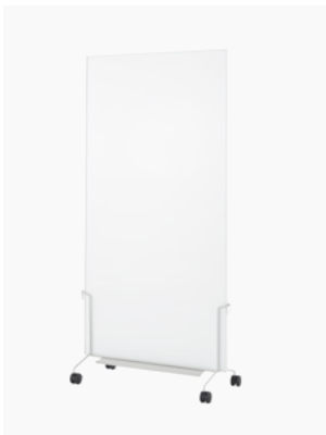
OE1 Mobile Easel