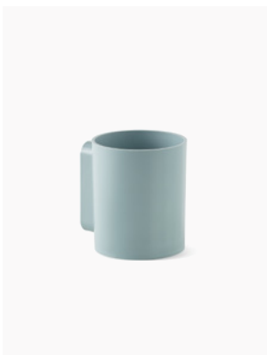
OE1 Marker Cup