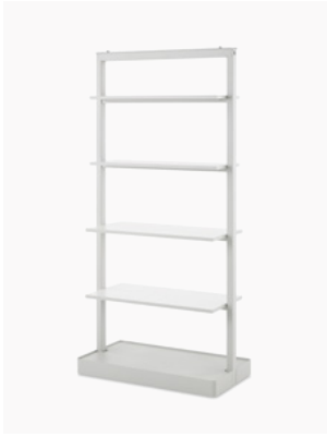
OE1 Agile Wall