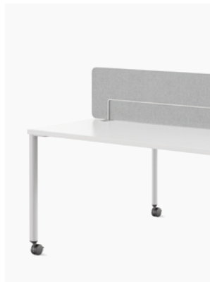
OE1 Movable Screen