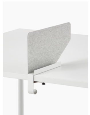
OE1 Boundary Screen