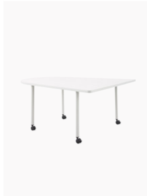
OE1 Huddle Table