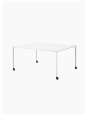
OE1 Project Table